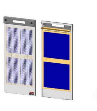
User-replaceable air filters