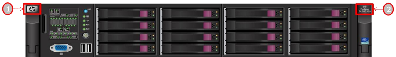
Figure 2: Standard HP bezel with custom OEM labeling at (1) and (2)

ProLiant server bezels can be modified as little or as much as you prefer, from a simple logo on the traditional bezel to a completely custom look and feel. Here are some examples of different bezel customizations.