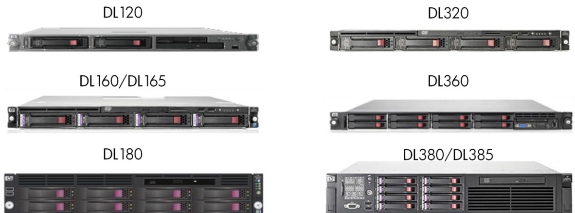
Figure 1: Popular ProLiant Servers for OEMs

Base your OEM solution on one of HP's energy-efficient industry-leading servers. HP offers several choices, entry level, high performance/large capacity servers and everything in between.