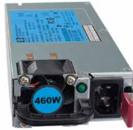
HP 460 W CS HE Power Supply