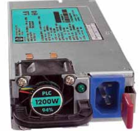
HP 1200 W CS Platinum Power Supply