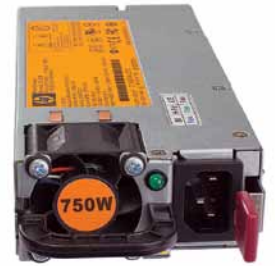
HP 750 W CS HE Power Supply