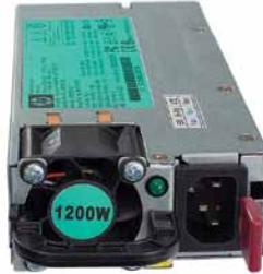
HP 1200 W CS HE Power Supply