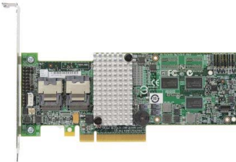
Figure 2. ServeRAID M5014 SAS/SATA Controller