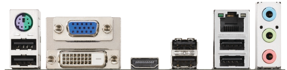
DH55HC board shown